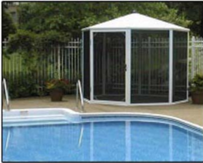
12' Round Urban Gazebo