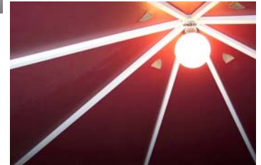
(light not included).