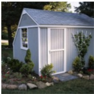
Shown here - 10' x 8' base unit with the door installed on the eave side!