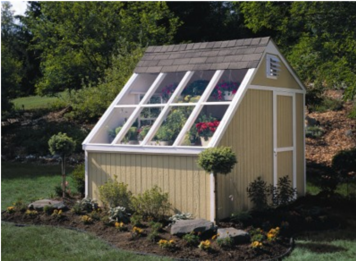
Shown here - Base Unit of 10' x 8' with door placed on gable side / optional Super vent installed